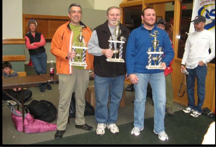
ETMM Division Champs - Silver Creek March 2008